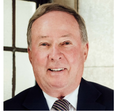
The Honourable Jim Munson*