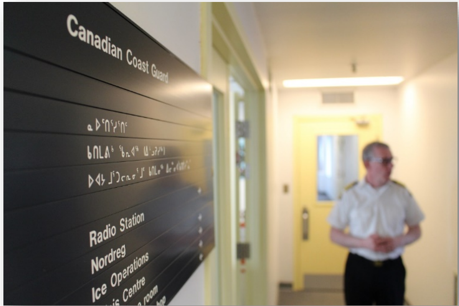
MCTS Centre in Iqaluit, Nunavut.

Finally, the committee recognizes how important it is for MCTS centre staff to communicate effectively with local people and those in distress. Members of the committee heard that at the MCTS centre in Iqaluit, none of the employees speak Inuktitut, a language spoken by most of the local population. The committee learned that this capacity once existed at the MCTS centre in Iqaluit and that the CCG is looking into restoring it.