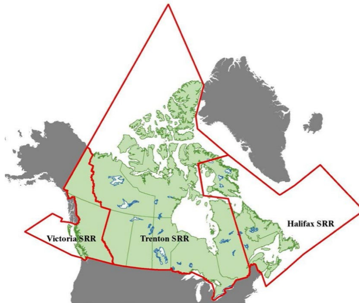
Figure 1.2 – Canada’s Search and Rescue Regions