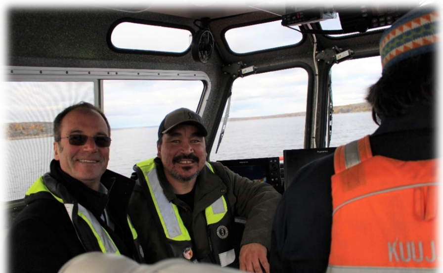
Senator Gold on the water with dedicated Canadian Coast Guard Auxiliary members during their fact-finding mission in Kuujjuaq, Quebec.

While visiting Kuujjuaq (Quebec), committee members heard that the model used to recruit CCGA members in the rest of the province is not effective in the Nunavik region. In part because communications between communities and communications between CCGA units and CCGA-Q are often cut-off due to bad weather and poor communication networks. As a result, members recruited in remote communities are often not provided timely training or any follow-up communications, leading them to lose interest. The committee is concerned by this possible loss of local volunteers and encourages the CCGA-Q to revise its recruitment process for the Nunavik region.