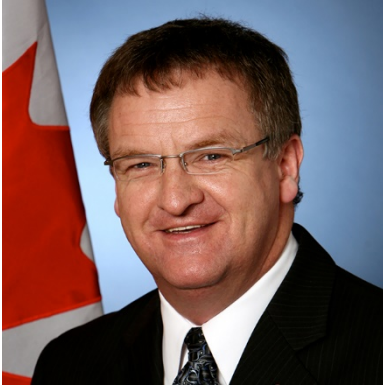
The Honourable Fabian Manning Chair*