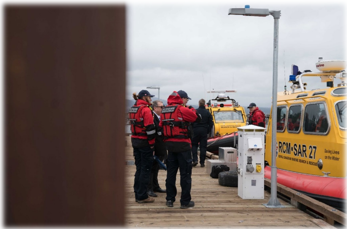
Senators were given a tour of the Royal Canadian Marine Search and Rescue facility and able to see CCG and RCM-SAR assets.

The fact that incidents of a maritime nature far outnumber all other aeronautical and terrestrial type incidents, combined with the sheer size of the Canadian SRR, underscores the need for strong and effective maritime SAR capacity and response from coast to coast to coast. We must not forget that Canada is a maritime nation.