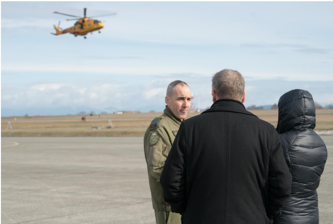
Discussing the details of SAR operations on the tarmac at 19 Wing Comox, British Columbia.

The reaction time adopted by the CCG was not put into question during the committee’s study. However, there was considerable discussion regarding what witnesses called the CAF’s “two-tier reaction time.” It was stressed that the two-hour reaction time guaranteed outside of working hours had lengthened the response time and resulted in missions becoming recovery-oriented instead of rescue-oriented. In their view, the CAF should have a reaction time of 30 minutes, 24/7/365, like the CCG.