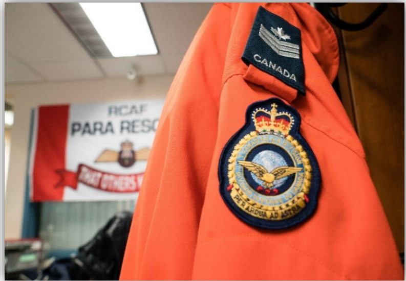
Senators visited the JRCC during its fact-finding mission to Victoria, British Columbia.