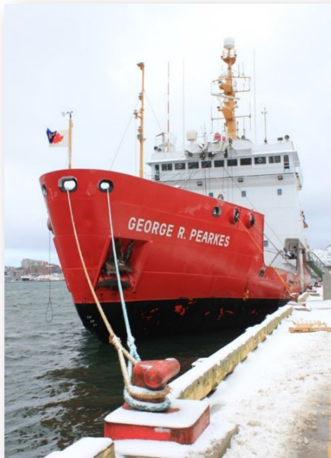
The CCGS George R. Pearkes , a light icebreaker and buoy support vessel docked in Newfoundland and Labrador.

The CCG and the CAF have organized their resources into three levels: primary, secondary, and other. In the event of a maritime incident, the JRCC determines the resources that will be tasked to respond based on the exact nature of the incident. The determining factors include: location; weather conditions; the number of people involved; the severity of the incident; accessibility of the incident; and, the availability and capabilities of the resources.