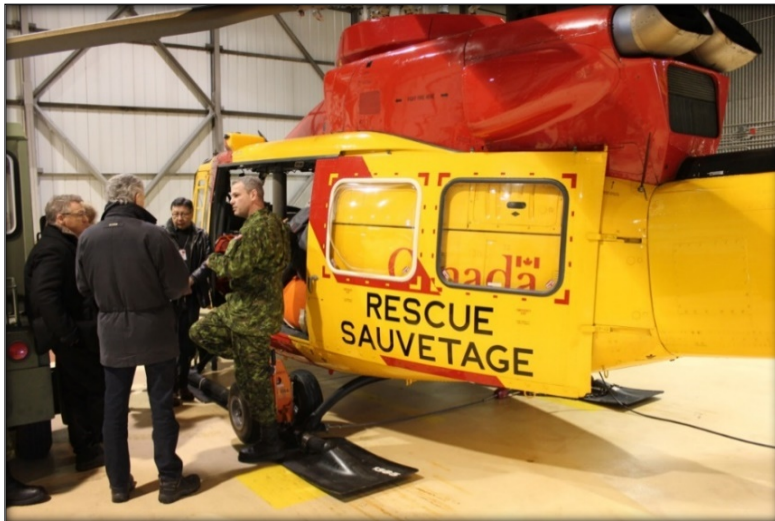
Senators visited the 444 Squadron, based at 5 Wing Goose Bay, Newfoundland and Labrador.

A distress incident at sea can occur suddenly and without warning, as a result of injury, mechanical failure, environmental conditions, lack of safety equipment, or human error. Once the incident has occurred, the person in distress (or a nearby vessel witnessing the event) must signal for help. A JRCC is notified of an incident by a call from a marine radio or cell phone, or a distress signal transmitted through a satellite-based system from an emergency locating beacon (or EPIRB) on a vessel, or by a MCTS centre. After receiving the distress call, the SAR Commander at the JRCC investigates to determine the nature of the distress call. JRCC staff records all available information about the person(s) in danger and determines the location of SAR resources